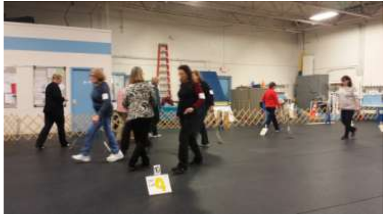
RALLY WALK THRU